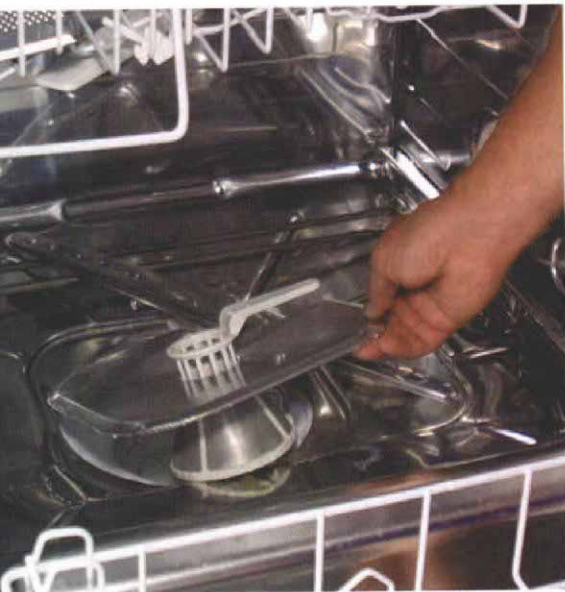
Removable filter can save a dishwasher. European-style dishwashers have mesh filters that can catch harmful debris such as broken glass before it can damage the inner workings of the machine.